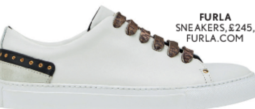
FURLA SNEAKERS, £245, FURLA.COM