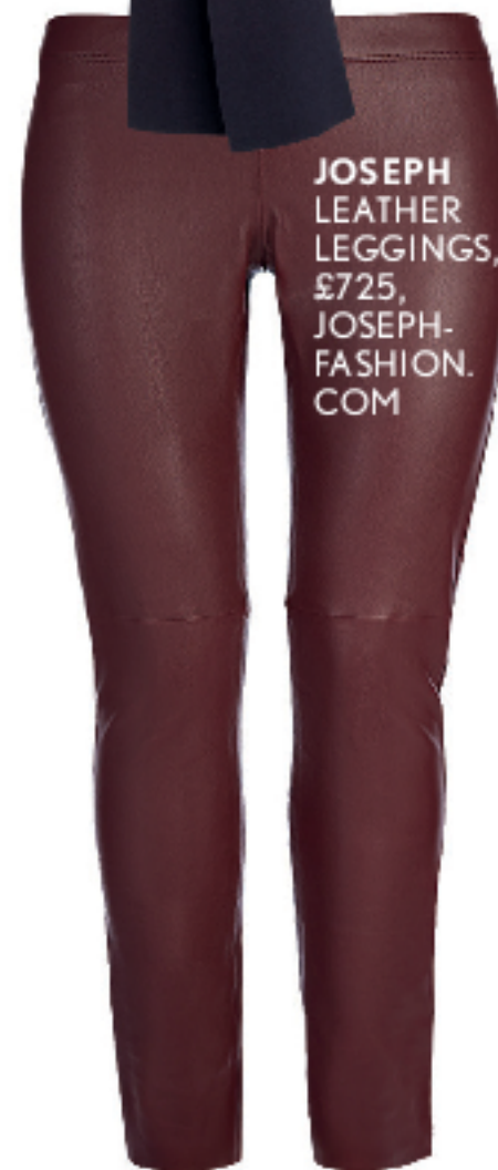
JOSEPH LEATHER LEGGINGS, £725, JOSEPH- FASHION. COM