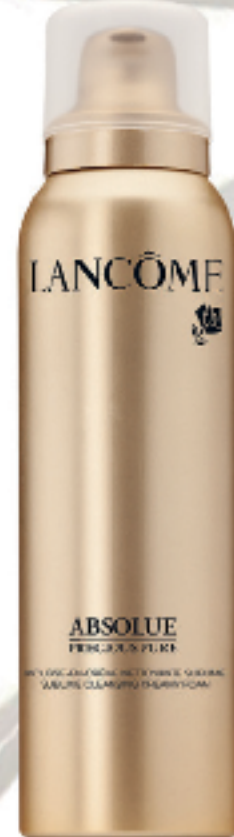
LANCÔME ABSOLUE PRECIOUS PURE SUBLIME CLEANSING CREAMY FOAM, £55