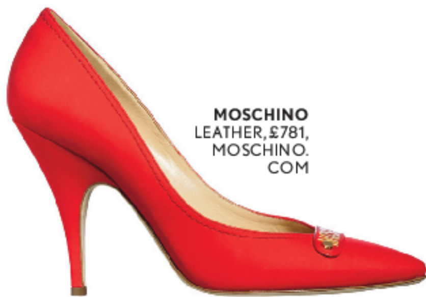
MOSCHINO LEATHER, £781, MOSCHINO. COM