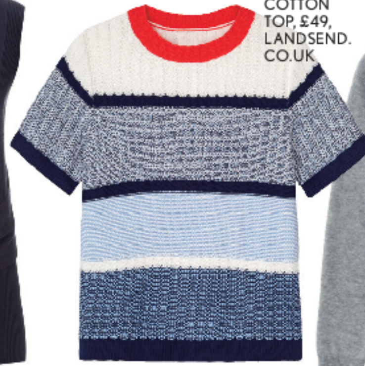
LAND'S END COTTON TOP, £49, LANDSEND. CO.UK