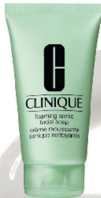
CLINIQUE FOAMING SONIC FACIAL SOAP, £16.50