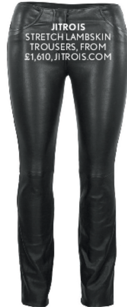
JITROIS STRETCH LAMBSKIN TROUSERS, FROM £1,610, JITROIS.COM