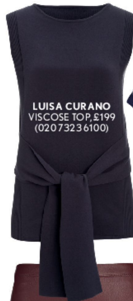
LUISA CURANO VISCOSE TOP, £199 (020 7323 6100)