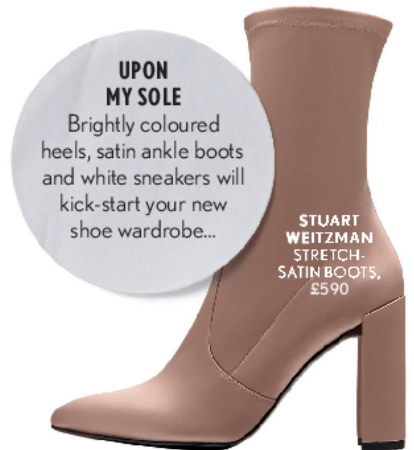
STUART WEITZMAN STRETCH- SATIN BOOTS, £590