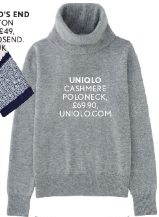
UNIQLO CASHMERE POLONECK, £69.90, UNIQLO.COM