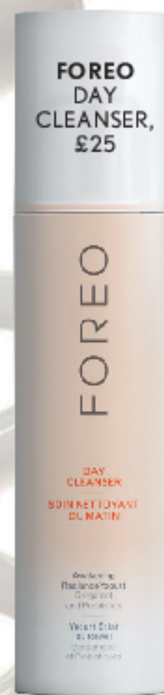
FOREO DAY CLEANSER, £25