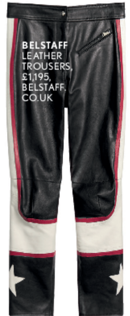
BELSTAFF LEATHER TROUSERS, £1,195, BELSTAFF. CO.UK