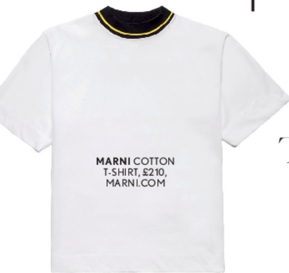
MARNI COTTON T-SHIRT, £210, MARNI.COM