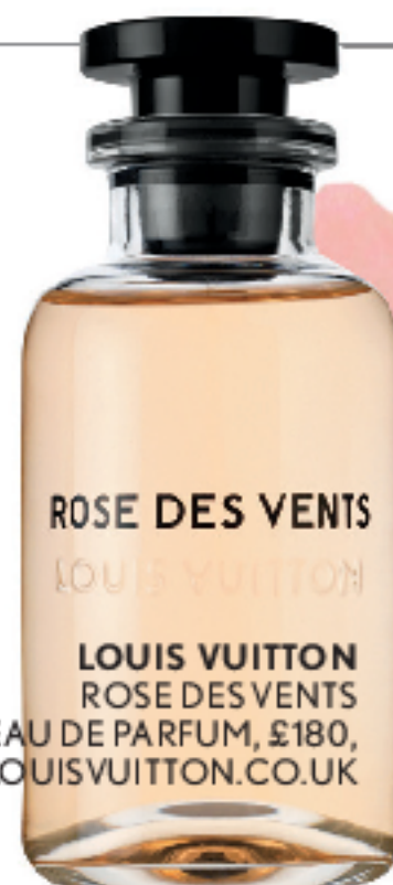
ROSE DES VENTS LOUIS VUITTON ROSE DES VENTS EAU DE PARFUM, £180, LOUISVUITTON.CO.UK