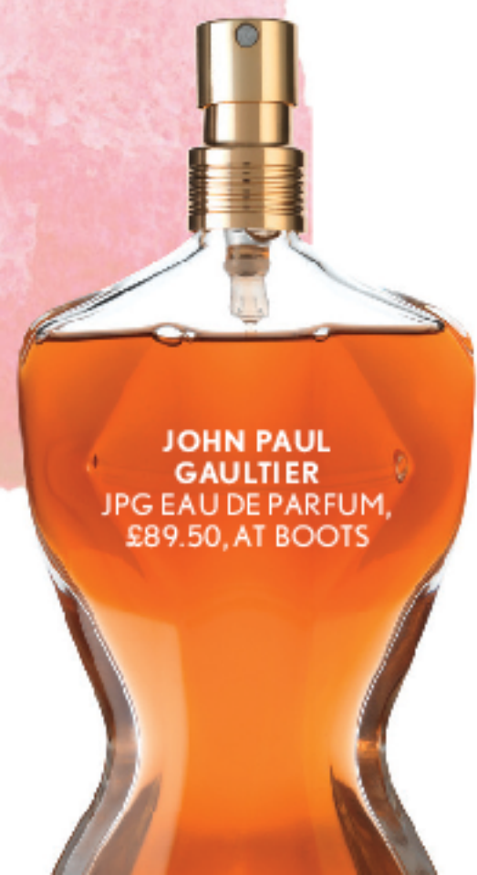
JOHN PAUL GAULTIER JPG EAU DE PARFUM, £89.50, AT BOOTS