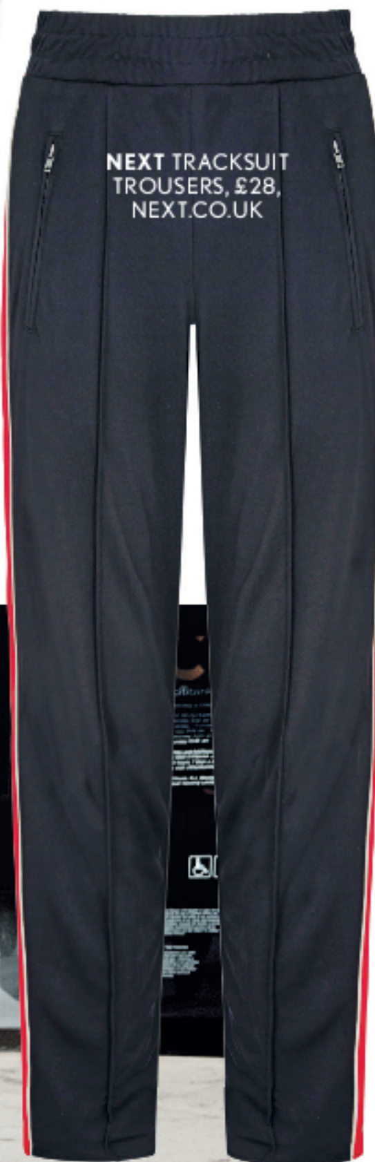
NEXT TRACKSUIT TROUSERS, £28, NEXT.CO.UK