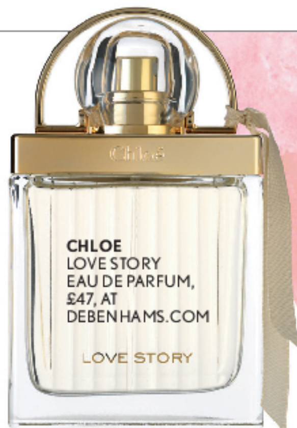
CHLOE LOVE STORY EAU DE PARFUM, £47, AT DEBENHAMS.COM

Improve health, body and mind in just nine new-year days with Bodyism's Detox kit