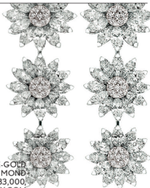
ASPREY WHITE-GOLD AND DIAMOND EARRINGS, £33,000, ASPREY.COM

Diamond drop earrings by Asprey will bring a touch of glamour to a simple outfit