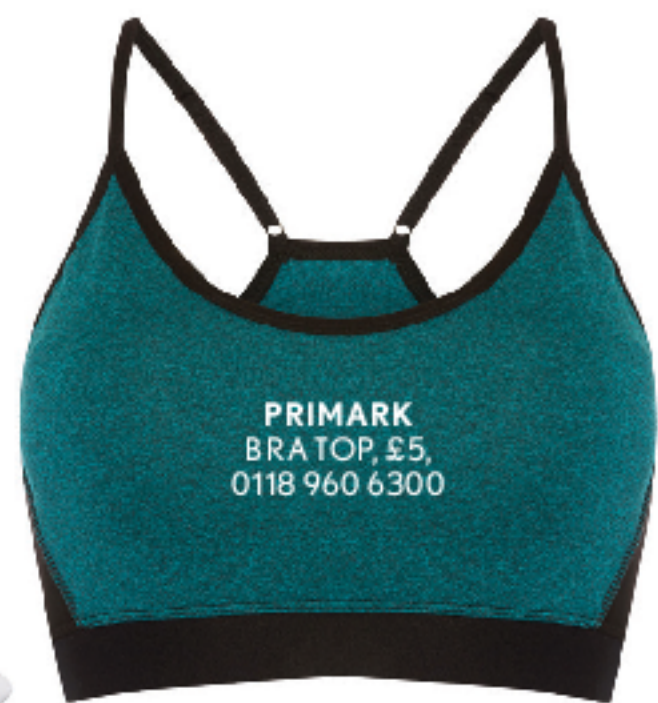
PRIMARK BRA TOP, £5, 0118 960 6300