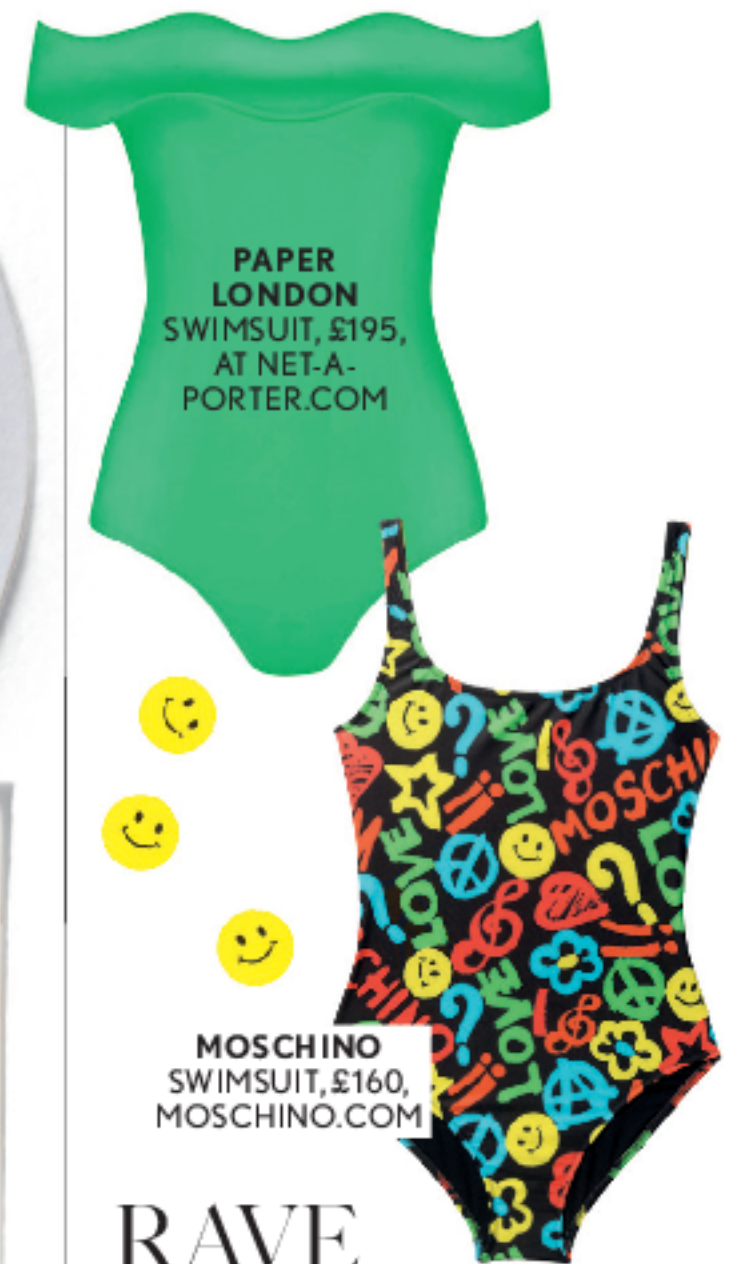
PAPER LONDON SWIMSUIT, £195, AT NET-A- PORTER.COM