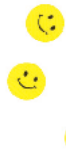
MOSCHINO SWIMSUIT, £160, MOSCHINO.COM