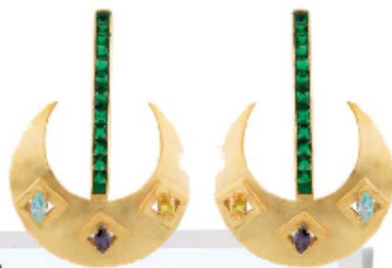
EVRA JEWELLERY GOLD VERMEIL AND SEMI- PRECIOUS STONE EARRINGS, £200, EVRAHEART OFEVE.COM

Come cocktail time, the colour to channel is gold. This play-on-proportions dress by Mes Demoiselles is both luxe and laid-back, making it the ultimate foil for a pair of show-stopping earrings.