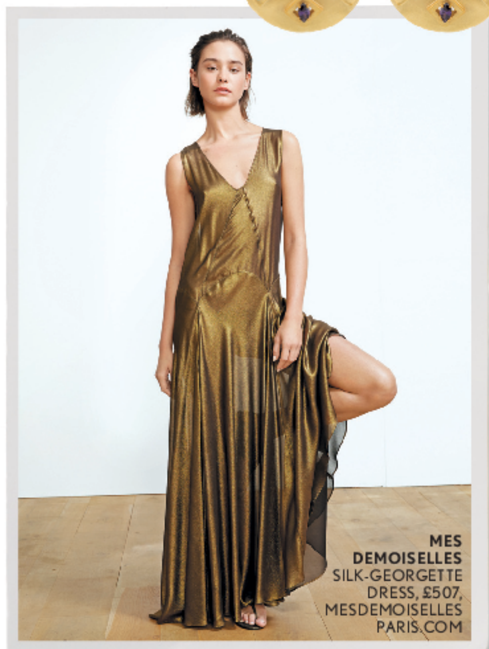
MES DEMOISELLES SILK-GEORGETTE DRESS, £507, MESDEMOISELLES PARIS.COM