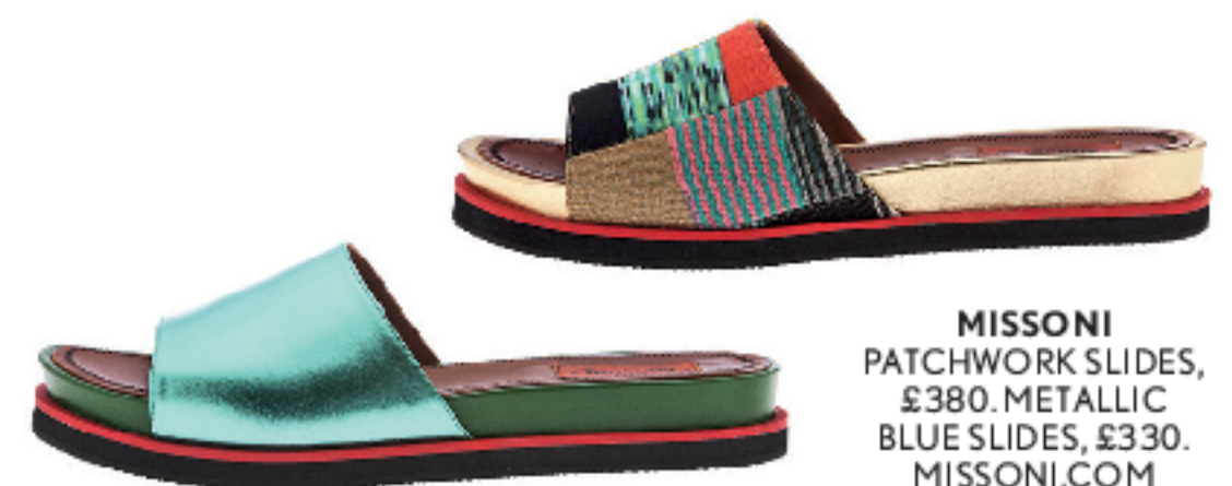
MISSONI PATCHWORK SLIDES, £380. METALLIC BLUE SLIDES, £330. MISSONI.COM

Eye-catching flats that mix colour and texture are a strong shoe trend this summer. Choose from Missoni's intricate patchwork and gleaming metallic, and step into the holiday season in style.