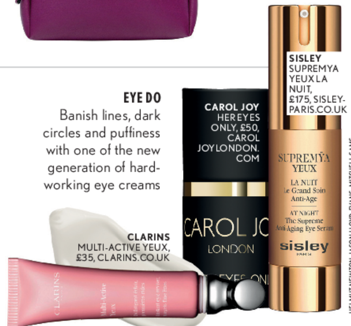
CLARINS MULTI-ACTIVE YEUX, £35, CLARINS.CO.UK

Banish lines, dark circles and puffiness with one of the new generation of hard-working eye creams