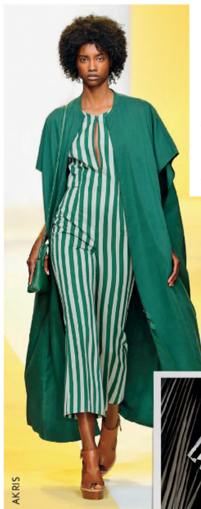
SILK COAT, PRICE ON REQUEST. COTTON JUMPSUIT, £2,555. LEATHER BAG, £590. BELOW: GEORGETTE SKIRT, £1,930. LEATHER BAG, £820. ALL AKRIS

How to style stripes? Follow Akris's lead and team them with a colour-matched Anouk clutch