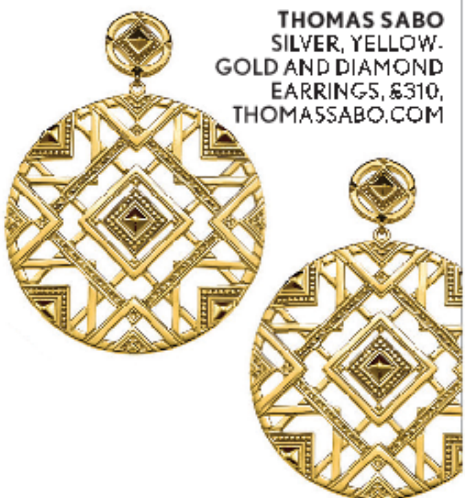
THOMAS SABO SILVER, YELLOW-GOLD AND DIAMOND EARRINGS, $310, THOMASSABO.COM

Jaw-grazing earrings are causing a stir – the longer the better