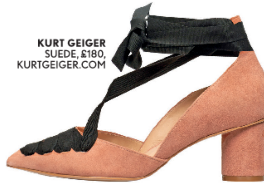
KURT GEIGER SUEDE, £180, KURTGEIGER.COM