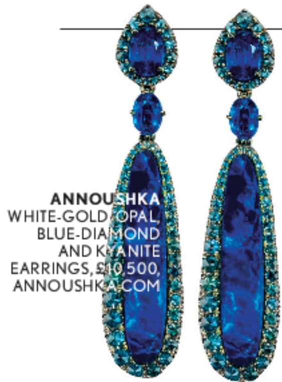
ANNOUSHKA WHITE-GOLD OPAL, BLUE-DIAMOND AND KYANITE EARRINGS, $10,500, ANNOUSHKA.COM