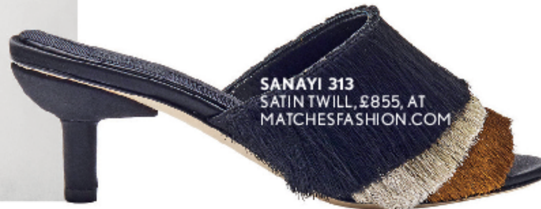
SANAYI 313 SATIN TWILL, £855, AT MATCHESFASHION.COM