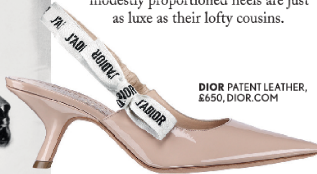
DIOR PATENT LEATHER, £650, DIOR.COM

Ugg has collaborated with Preen by Thornton Bregazzi for its s/s '17 London show. Making their debut on the runway as a result? Two flatform styles blending comfort and urban cool. £350; Ugg.com/uk